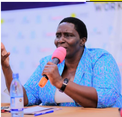
Asamo Hellen Grace(MP)

Minister Of State for Disability Affairs